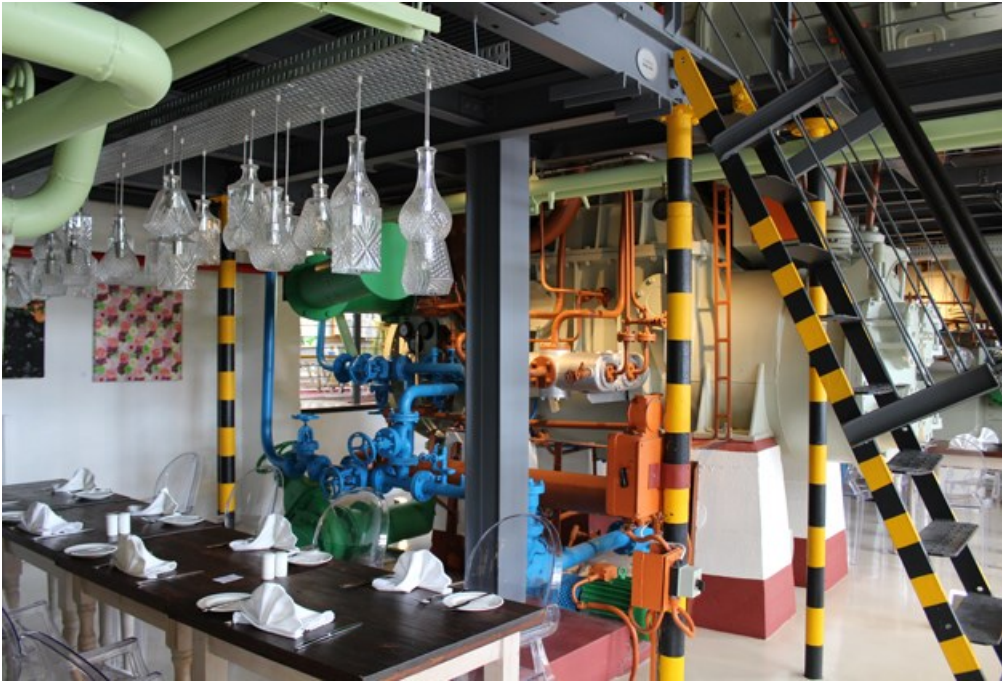
The hotel offers light meals and pub fare in the newly opened Gastro Pub. Sip cocktails and snack on sticky chicken wings while admiring the massive lifting hook and chains from the power plant days or head across the street to The Turbine owned Col'Cacchio pizzeria if you're looking for delicious Italian options.