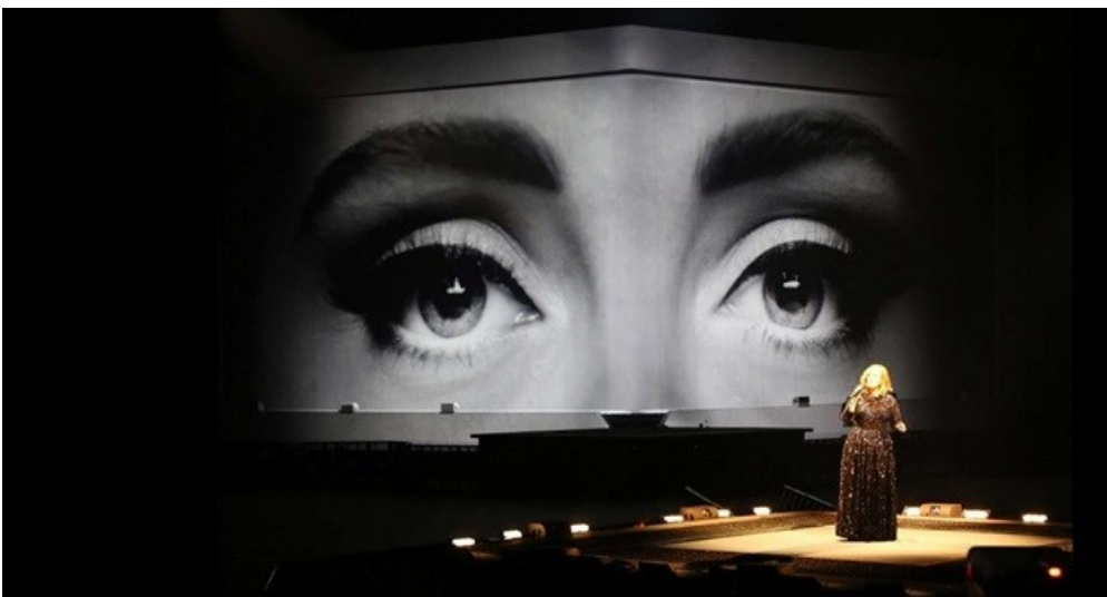
Adele's World Arena Tour.