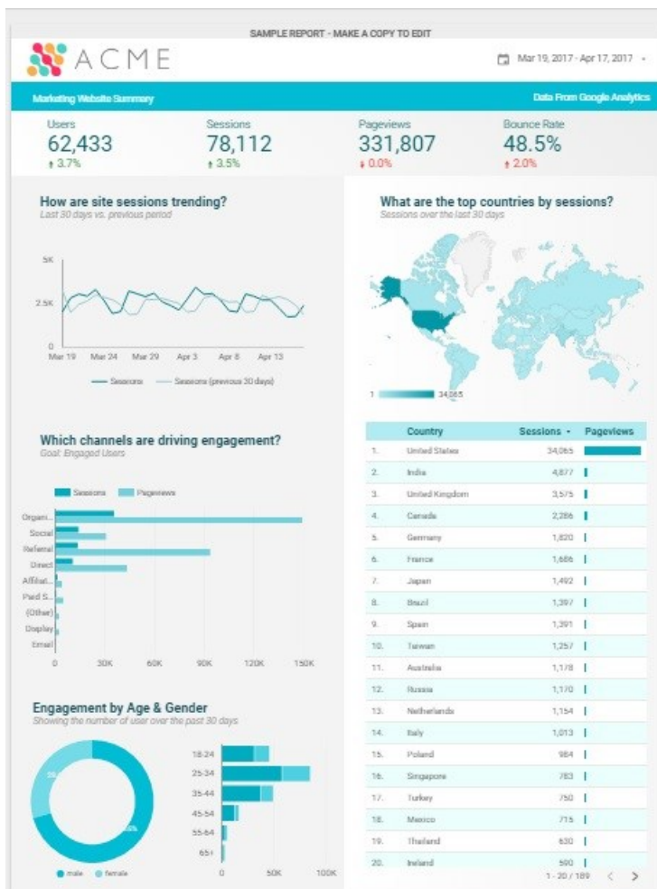
Figure: sample report and template in Google Data Studio; https://datastudio.google.com/org/1fMluf7lQQ63gS4ye-R52A/reporting/0B_U5RNpwhcE6SF85TENURnc4UJA/page/1M/preview?hl=en

There are several free reporting solutions from Google that can help experts to create insightful and visually stimulating reports. With the addition of Data Studio, we are able to enhance offerings in a robust and visual way. The reality is that every business (and every person) has varied reporting needs and so there is very little chance of finding one tool that is the perfect solution for everyone. If you are looking to drive reporting efficiencies and streamline day to day work then you need to be willing to compromise; be that cost, time saving or features.