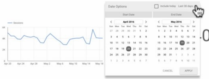
Image: Introduction to Google Data Studio: https://www.youtube.com/watch?v=6FTUpceqWnc