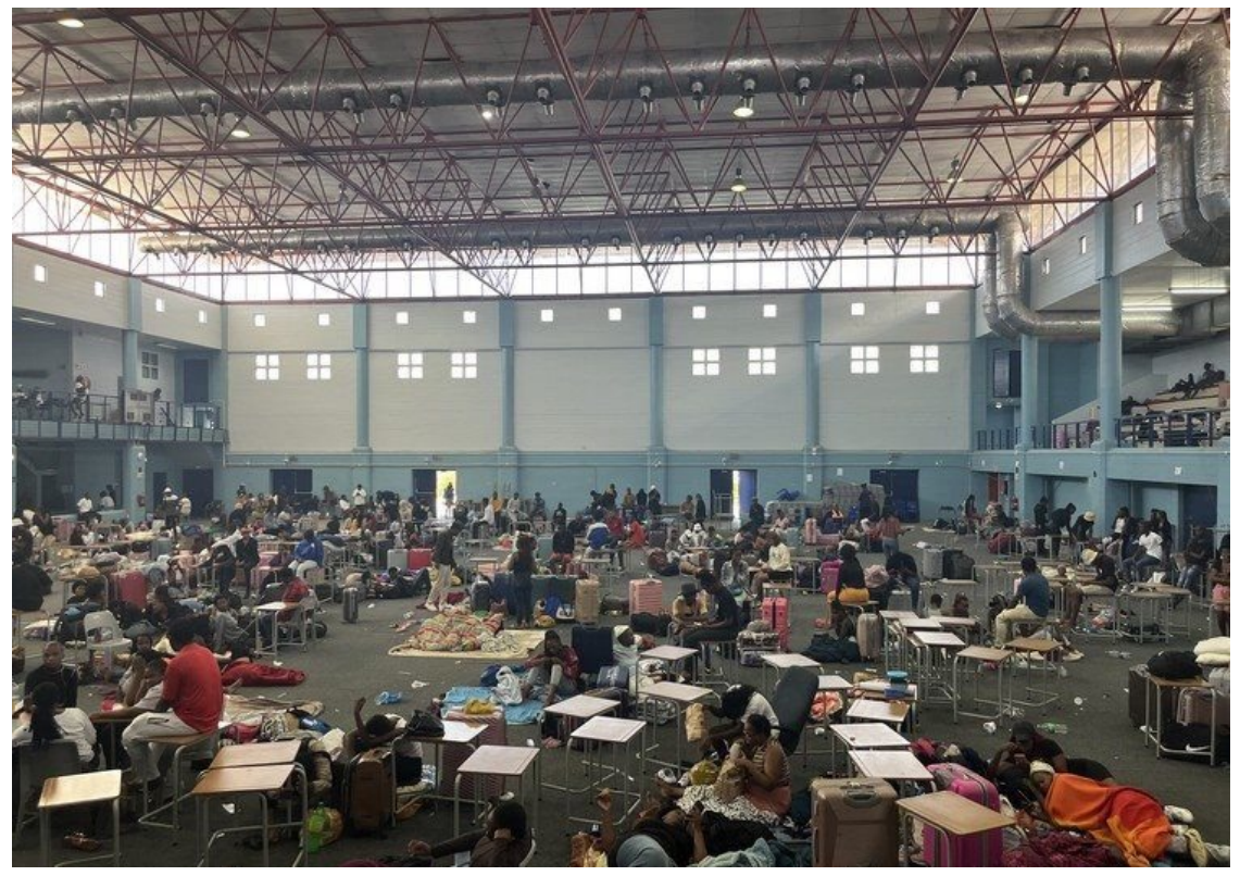
The Cape Peninsula University of Technology (CPUT) in Cape Town has provided emergency accommodation to students while they try to find housing for them. But living in the university's crowded multipurpose hall has not been easy.

The university says its own accredited and leased residences have already reached full capacity.