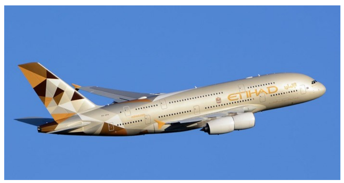
Etihad Airways A380

As Etihad Airways marks the 10th anniversary of flying to Sydney, its first Australian destination, it has announced that all 14 weekly flights on the Abu Dhabi - Sydney route will be operated with its flagship A380 aircraft, effective 29 October. The current daily A380 Sydney flights will be joined by a second daily superjumbo service.