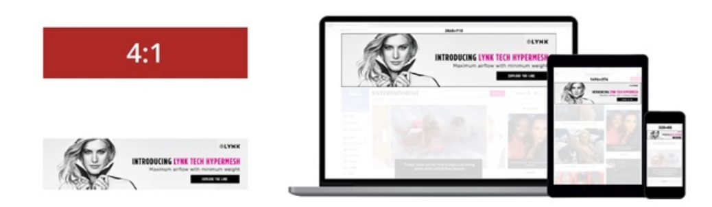
Illustration of Flexible, Ratio-based Ad Sizes.

360 degree video and VR rich media: Virtual reality and augmented reality are some of the most talked about subjects in tech these today. This technology will change the way we as humans communicate, learn, create and most of all, how we are entertained.