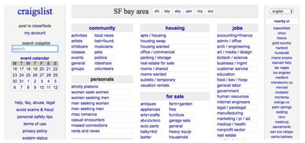
craigslist.com- an example of a Brutalist website