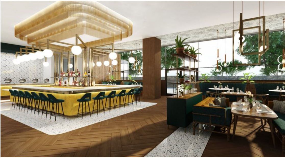
Courtyard Hotel Waterfall City - restaurant

On completion of Courtyard Hotel Waterfall City and City Lodge Hotel Maputo, the group will offer 8070 rooms at 63 hotels in six countries.