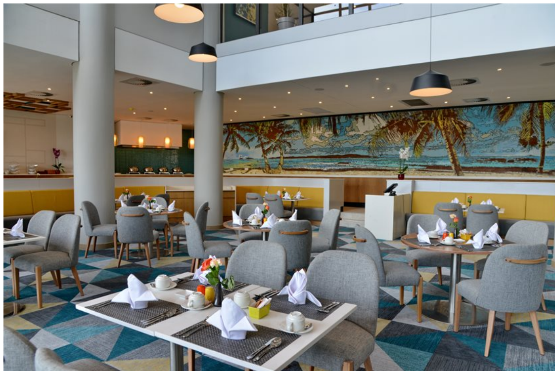
City Lodge Hotel Maputo - restaurant

The JSE-listed City Lodge Hotel Group celebrated its 35th anniversary in August, a testament to the continued support from guests, shareholders, management, employees and other stakeholders in helping to build a South African icon in the hospitality industry over the years.