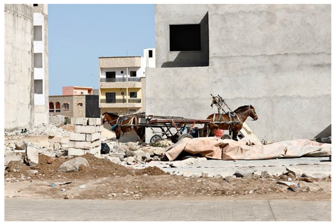
Le peuple du mur #2 by Mame-Diarra Niang, 2014, inkjet print on 300g cotton paper

Self as a Forgotten Monument is the first museum solo exhibition by Mame-Diarra Niang and is a survey of the artist's practice from the past decade, bringing together significant bodies of work in dialogue in a spatial choreography. Niang's prolific practice is characterised by an exploratory, abstract and subversive approach to lens-based media, such as photography and immersive audio-visual installation. Her work is an act of remembering, through which she resists categorisation and assumptions about geographies and specificities.