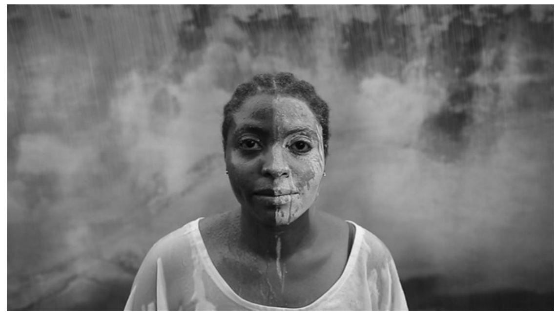
Here by Nyancho NwaNri, 2021, four-channel video installation with sound, cloth

The number seven acts as an anchor throughout the exhibition, with seven artists symbolising the spiritual significance the numeral holds across various belief and cultural systems, from the past to the present. Seven has signified completion and perfection, has been a symbol of divine introspection and perception, and represents healing and fulfilment.