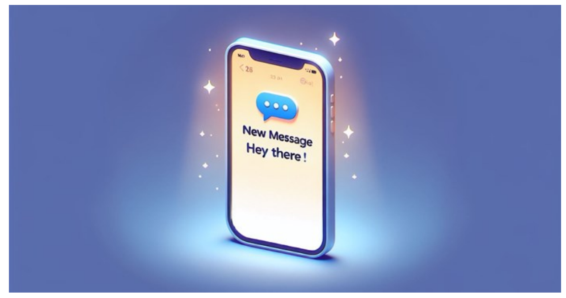
RCS interoperability will open the marketing messaging floodgates.

A recent <u>study has revealed</u> that over the next four years, enterprise spend on generative AI via mobile messaging channels is set to surge by 1,250%, rising from $830m in 2024 to $11bn by 2028. The research forecasts that the key driver for this remarkable growth will be the capacity to automate the personalised content, including marketing initiatives and customer interactions via chatbots.