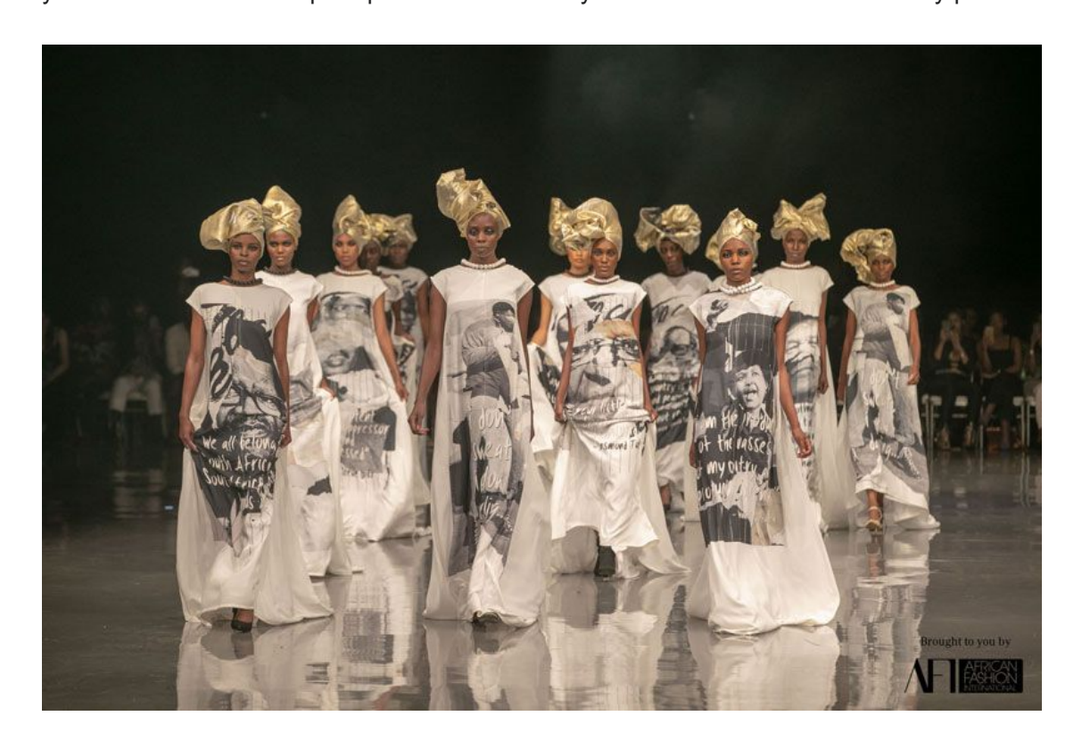
III What advice would you give to up and coming African designers?

Prints, prints, and more prints. White blouses are also very important, but more than anything else, the Toga dress and the yellow and black Madiba quote-printed skirts from my collection are must-haves and my personal favourites.