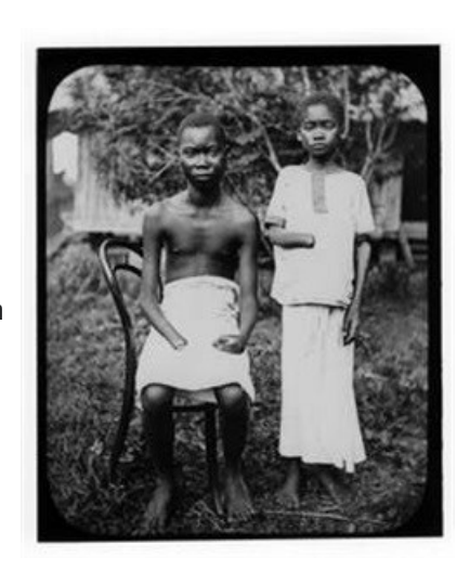
Atrocities: two youths in the Belgian Congo with severed hands.

Examples from the imperial past tell us that there are deeply entrenched norms in how British agencies and institutions encourage us to think about poverty and suffering