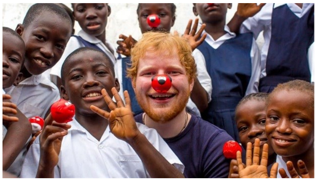
Ed Sheeran in the Liberian capital Monrovia for Red Nose day 2017. Comic Relief

On the eve of Sport Relief 2018, Liz Warner - the head of the TV fundraiser - <u>announced a new approach</u> to its on-location films. The decision followed <u>accusations</u> of "poverty tourism" and "poverty porn" which were <u>made by a charity watchdog</u> against three films produced for Comic Relief and the Disasters Emergencies Committee in 2017.