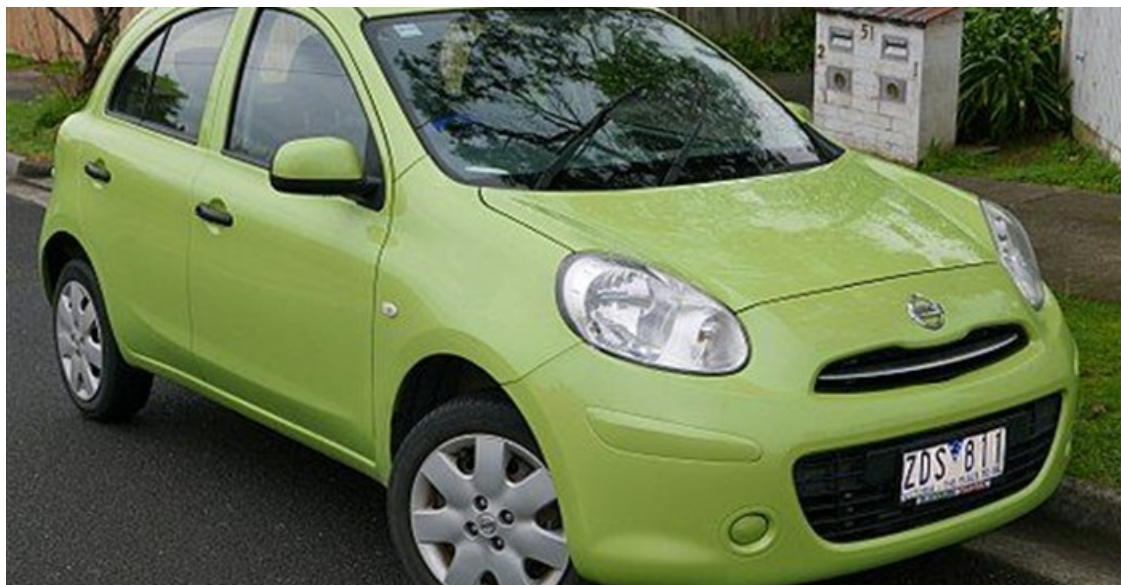
Old bubble shape. By OSX [Public domain], from Wikimedia Commons

These elements, along with the rest of the car's carefully considered exterior design, gives it a bold, athletic look - as if it's ready to take on any challenge. It might not be able to take on any challenge, but it will sure give it a good go.