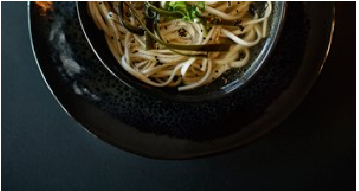
Into the Cold

Last of the savoury dishes, Ocean Blue consists of lobster claws and a sweet caramel like a brown butter sauce. Super moreish, this is one dish you just dive into, brown butter sauce dribbling down your chin and all.