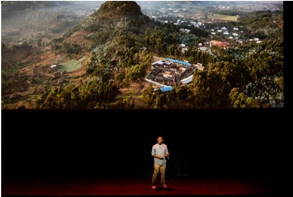
On the Design Indaba 2019 stage: The African Design Centre in the hills of Rwanda, outside Kigali.