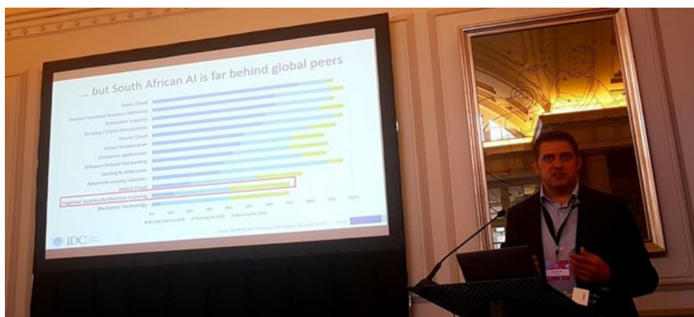
Schaefer presenting at the Adobe CX Forum

Empowered with the right data, organisations can tie objectives for digital channels to business outcomes. For example, social media can be measured against the business objective of reducing costs through lower call centre volumes by using the percentage of queries resolved via social media as a KPI.