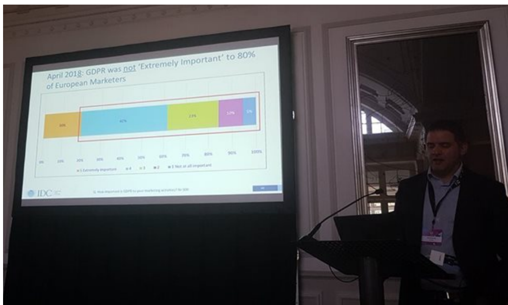
Schaefer presenting at the Adobe CX Forum

That's why Schaefer predicts that spending will increase significantly for data analytics and its application in the AI space, with a special opportunity to adopt AI for business in South Africa.