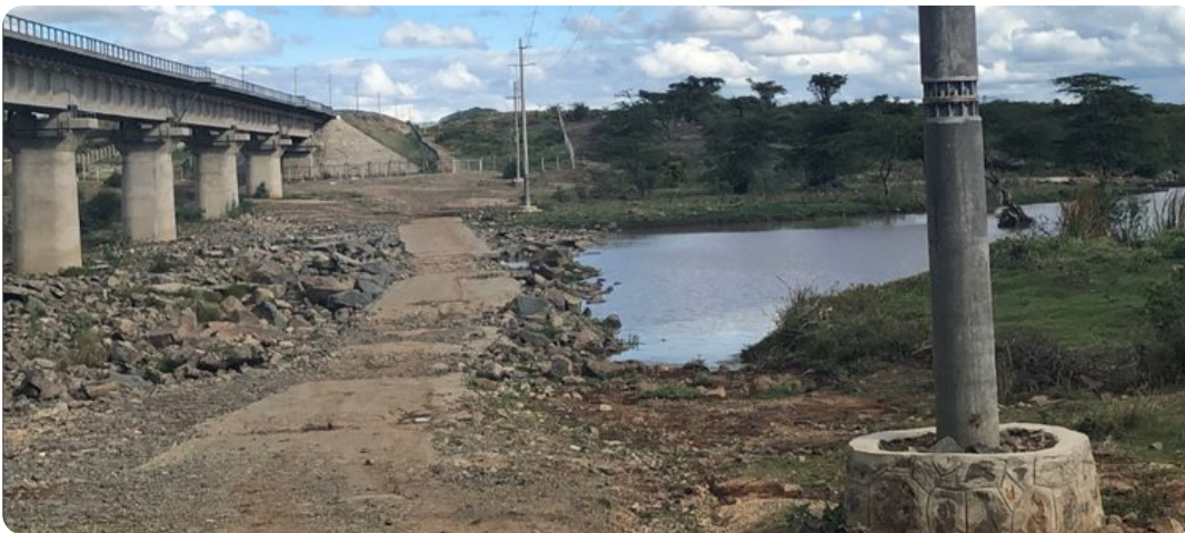
A blocked river in Kitengela.

In Voi, county officials explained how storm water flooded low lying homesteads and farms during heavy rains.