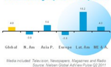
FMCG: % change Q2 2011 vs. Q2 2010

FMCG advertising posted its lowest quarterly growth since the Q1 2009 Pulse report: 4% globally with notable declines of -3.6% in Europe and -3.0% in North America. The decline in FMCG adspend was particularly surprising as the Easter holiday, traditionally a key occasion for FMCG and confectionary advertising in Europe and North America, took place in late April this year, which should have pushed more ad revenue to the beginning of Q2, noted Beard. Within FMCG, cosmetics and toiletries posted the most robust growth of 6.9% and accounted for nearly one in every ten dollars spent globally.