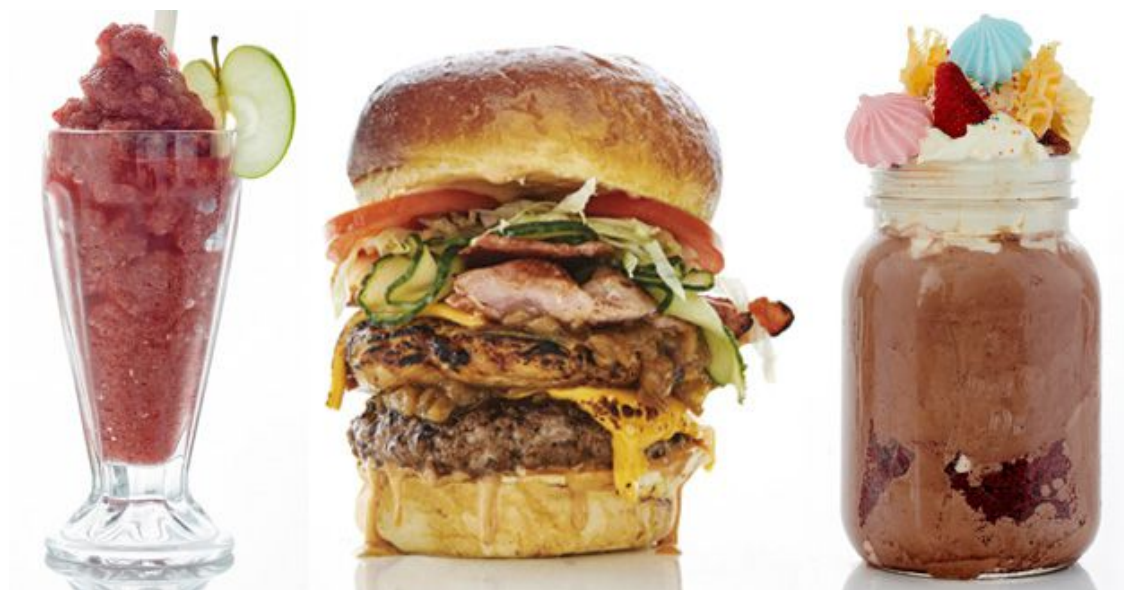
Gibson's fat-free apple, lime and mixed berries shake; Rolls Royce 'the ultimate' burger; and Red Velvet Neopolitan Freek shake.

I'd heard there were new shakes to choose from, covering all the bases from fat-free fruity crushed ice options to vegan shakes like the kale, avo and mixed berry; or the cherry fudge frozen yoghurt version; bringing the tally up to 217 – yes, you read that right, two-hundred-and-seventeen. With more to come!