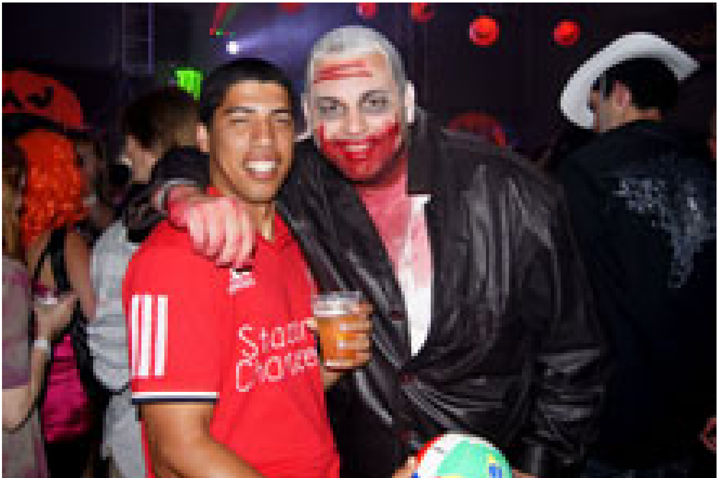
I arrived at City Hall to a gruesome sight of ghouls, zombie nurses, werewolves, vampires and many other monstrosities. The entrance was decked out with cobwebs and dim, eerie lights, making it appear like a bone-chilling set from a classic