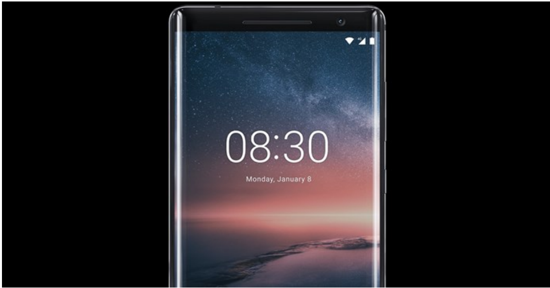
Nokia 8 Sirocco

Its curved glass finish, envelops a precision-crafted stainless-steel frame to deliver a fusion of strength and beauty. Just 2mm thin at the edge, it combines a curved edge-to-edge pOLED 2K 5.5-inch display with smaller bezels and moulded body curves to create an ultra-compact profile.