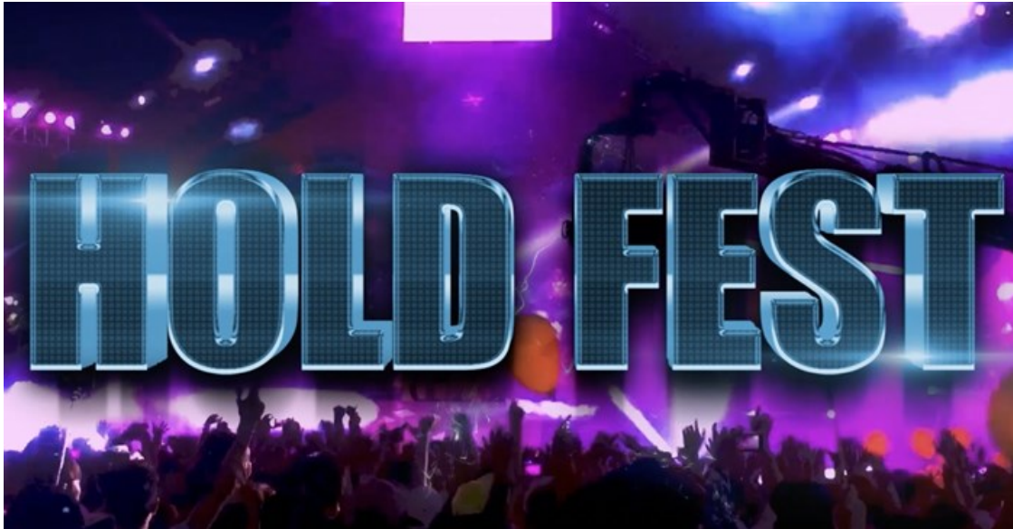
Image supplied. #StopHoldMusic, Naked's new campaign imagines an alternative universe where hold music is the new rock and roll, and fans get excited about

#StopHoldMusic, Naked's new campaign imagines an alternative universe where hold music is the new rock and roll, and fans get excited about.