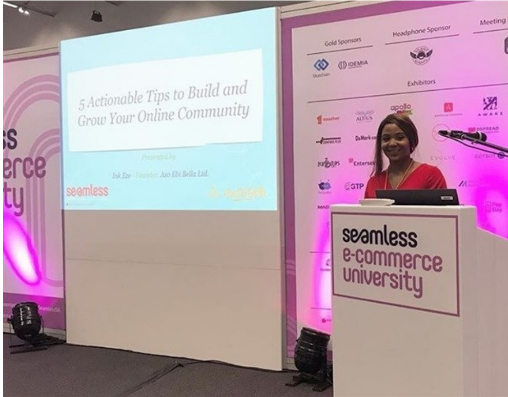
Ink Eze.

Nigerian entrepreneur Ink Eze knows how to grow an online community: her wedding community Bella Naija Weddings has over three million followers on Instagram and its counterpart, the African fashion community Aso Ebi Bella is a close second with 1.8 million Instagram followers.