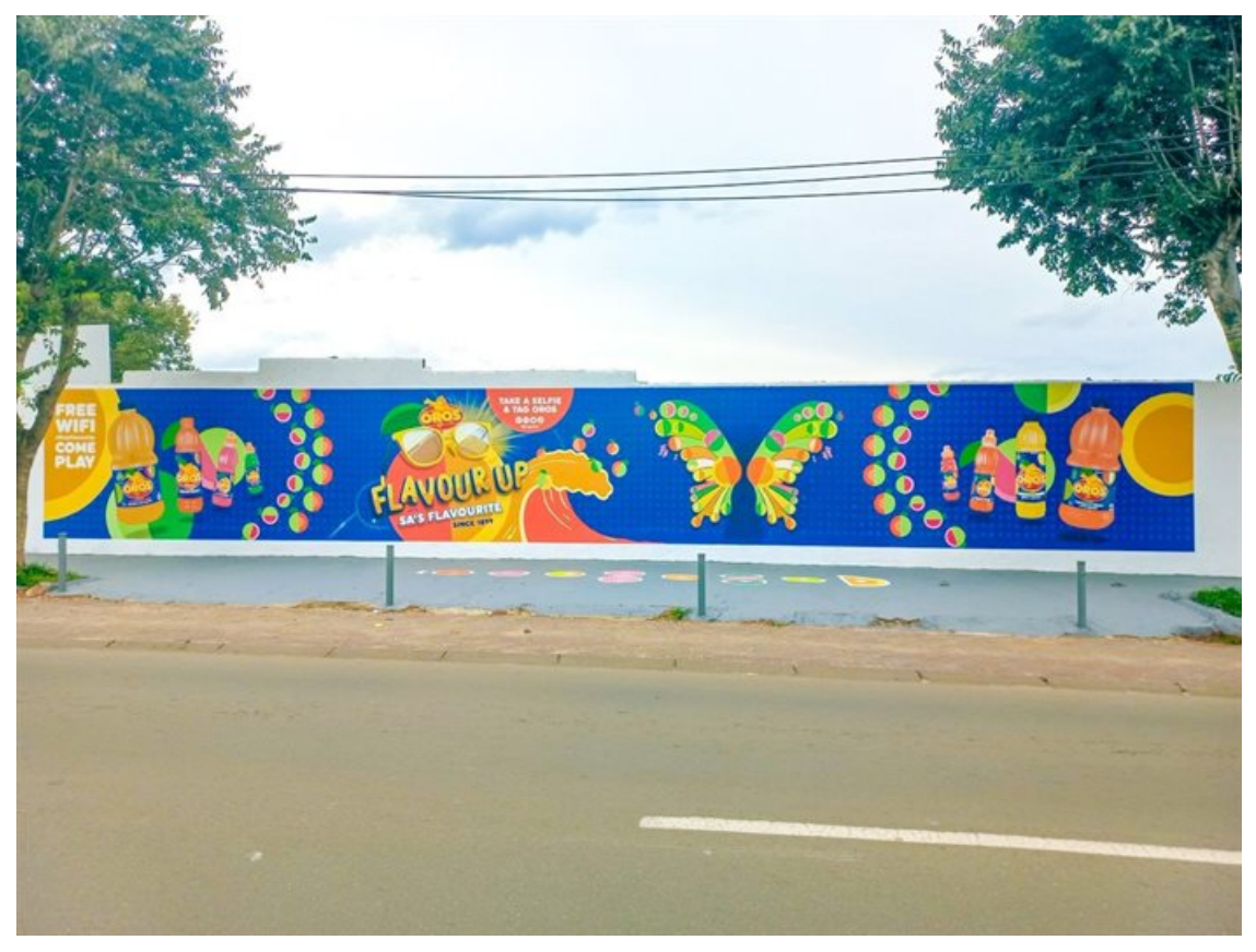
Mashupa Street, Orlando East - Sow eto (Johannesburg)

The strategic importance of choosing wall murals for this campaign's success is because of the mass reach that it presents, as nearly 25% of South Africa's 60 million reside in townships, and historically these areas were deemed low-income areas, but that is swiftly changing. A recent study by Survey 54 finds that Soweto, which is the largest township in South Africa, has a purchasing power of over R5bn and is mainly exchanged in the form of cash at small convenient stores, commonly referred to as spaza shops. Collectively, there are over 150,000 of these stores nationwide and are responsible for as much as, 5% of a $419Bn national economy. Considering that Oros is amongst the brands stocked in these stores across the country, it makes for an effective campaign on the bottom line, whilst maintaining cost efficiency for its cost per reach.