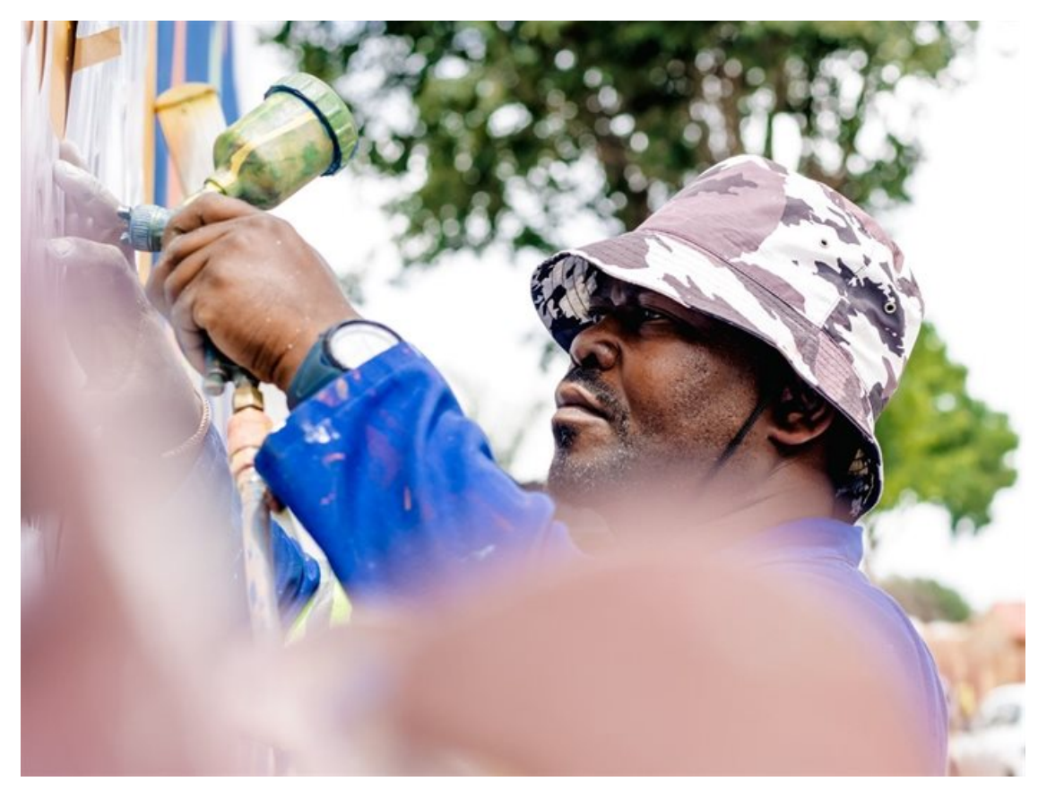
Production artist on site preparing the artwork

To showcase this exciting campaign, Owakhe Media recorded a highly engaging visual production where a group of kids can be seen engaging with the mural by, connecting to the free Wi-Fi, taking selfies, and playing hopscotch. This is taken a step further by bringing the wall to life, using an innovative tool known as, Augmented Reality (AR). AR technology adds digital elements to the physical world by using a camera lens of a smartphone, allowing users to interact with their environment in new and exciting ways. The interactive and immersive nature of AR appeals to younger audiences who are accustomed to consuming media through their smartphones and other devices. This is a new and exciting way for brands to create memorable experiences for their audiences and a solid bridge between measuring the impact of OOH, through digital marketing.