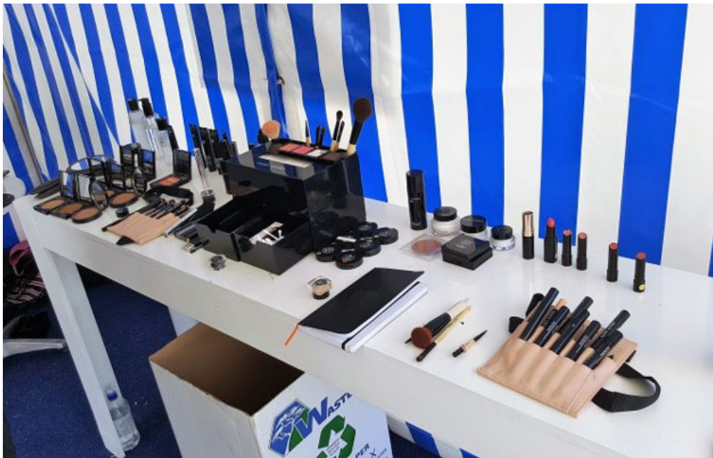
Bobbi Brown Beauty Bar