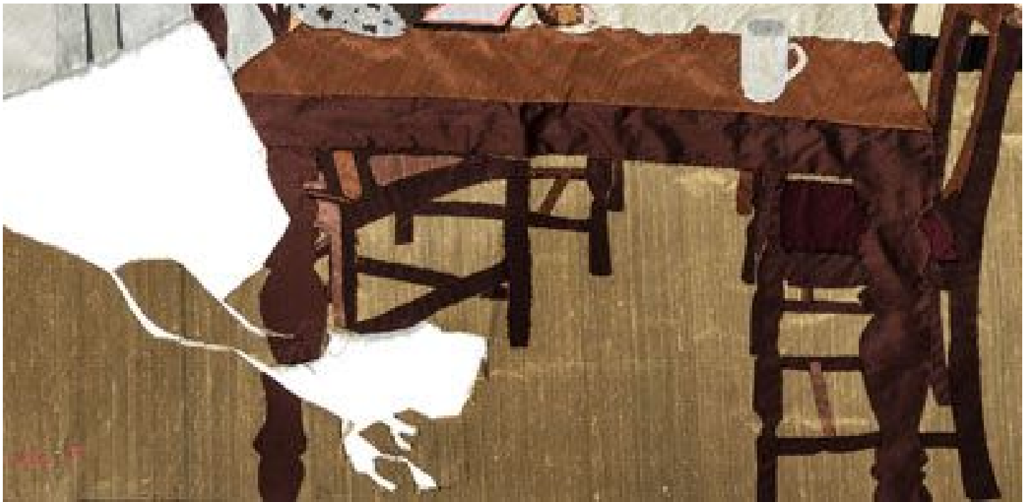
Vision of Love

Zangewa primarily uses raw silk offcuts to create intricate hand-stitched collages in a flat, colourful style. Her figurative compositions, depicting a woman going about her every day domestic life, explore how women are so often disadvantaged by multiple sources of oppression: race, class, gender identity. She sensitively illustrates this intersectional identity in a contemporary context and challenges the historical stereotyping, objectification, and exploitation of the black female body.