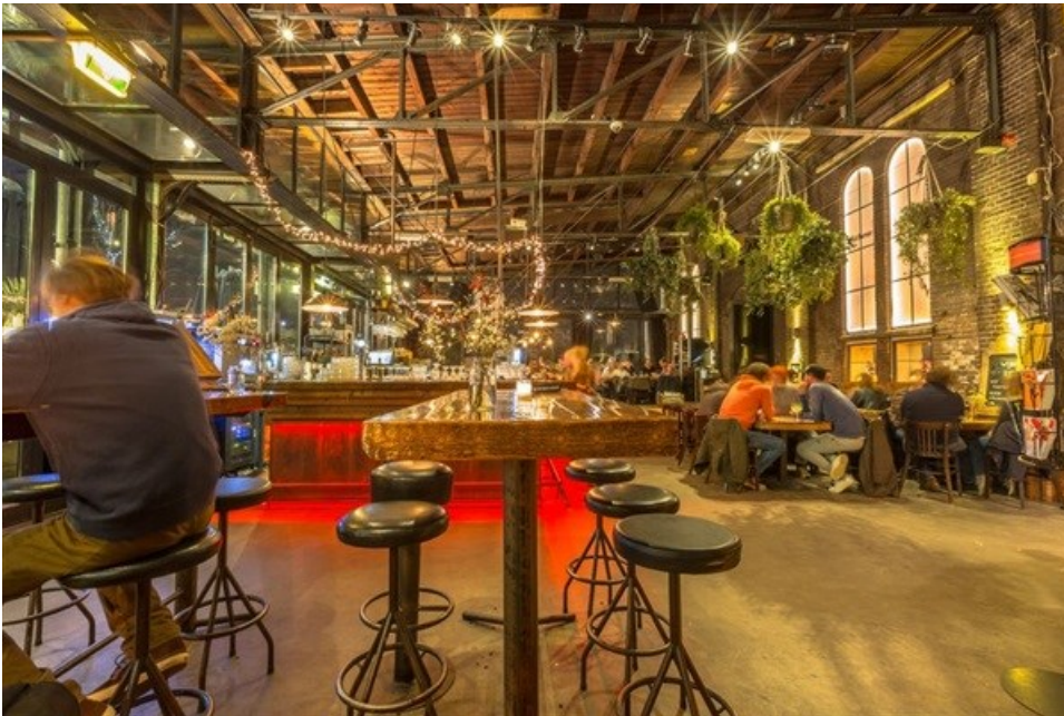
Every second restaurant seems to sport an industrial interior, except we now don't use natural brick, it's printed on wallpaper - Nemeth.

Another reaction to mass-production is that consumers have developed an affinity for the past. "Designers and product developers are now going back and drawing inspiration from age-old techniques and materials used to create things." This fascination with the past is evidenced by the popularity of brands like Smeg, the revival of the vinyl record business and the renewed interest in craft beverages and artisanal food.