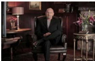
Santam retort to Nando's taunt.

The best example of this would be the Nando's vs Santam match-up. After having poked fun at a conceptually intelligent but innately corporate campaign for the yellow umbrella, Nando's proved to be anything but chicken, giving it right back to the fast-food chain with a CSI (corporate social investment) challenge aired on national TV.