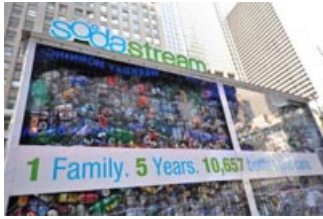
One of the global Cage Challenge installations.

As a proponent of experiential marketing, I quite enjoyed the innovative engagement approach the brand had adopted in proving a cause-related marketing point. SodaStream saved you from destroying the environment through creating your own in-house cool drink factory. I got it. Cool. *Mental note*: I must talk to the strategy department about brand installations.