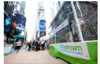
"Cages" have been rolled out globally, including this display at Times Square, NYC. Source: