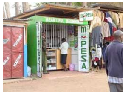
An Mpesa agency in Nairobi.

African countries using the system include Egypt, Lesotho, Mozambique and Tanzania, and it has also been rolled out in India. A savings version has been set up as well, allowing those without access to formal banking systems to earn interest on their savings.